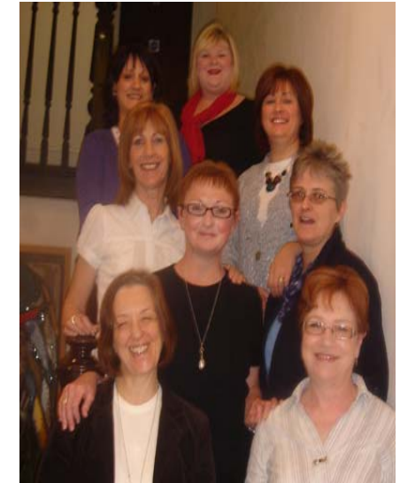
Some of The clinical team

Workers, and a Medical Practitioner. The most appropriate treatment will be discussed between you and the nurse in charge.